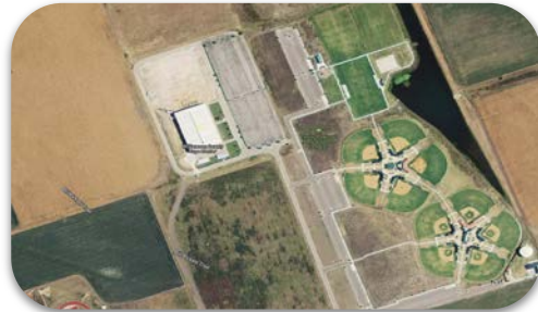
Williamson County Expo, Taylor (Confirmed)

William County Expo is a renown site in Taylor that has two large capacity parking lots where a vaccination center could serve hundreds of patients per day.