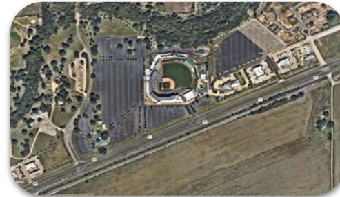
Dell Diamond, Round Rock (Confirmed)

Dell Diamond is the home stadium of the Round Rock Express. This stadium has access to multiple parking lots capable of running a massive vaccination project. This stadium can serve as the central hub of vaccinations for Round Rock.