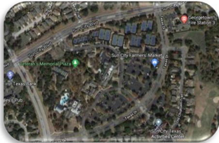
Sun City Texas Ballroom (Confirmed)

The Sun City Texas Ballroom has previously been used for a mass vaccination flu clinic and has ample parking to support a large vaccination site. Surrounded by a plethora of residential areas, this site has potential for outreach beyond this community.